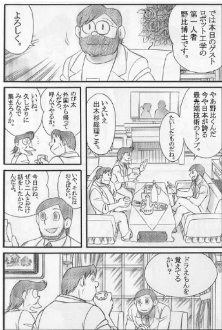
Doraemon final episode(s) http://www.kejut.com/doraemon1

漫畫迷杜撰結局罪成多啦A夢假書炒價 $1000 http://appledaily.atnext.com/template/apple/art_main.cfm?iss_id=20070606&sec_id=462&subsec_id=465&art_id=7179444