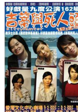
吉蒂與死人頭 http://show.fmtv.net/kittyhunter/ http://www.inmediahk.net/public/article?item_id=64816&group_id=31

Illegal arts http://www.illegal-art.org/